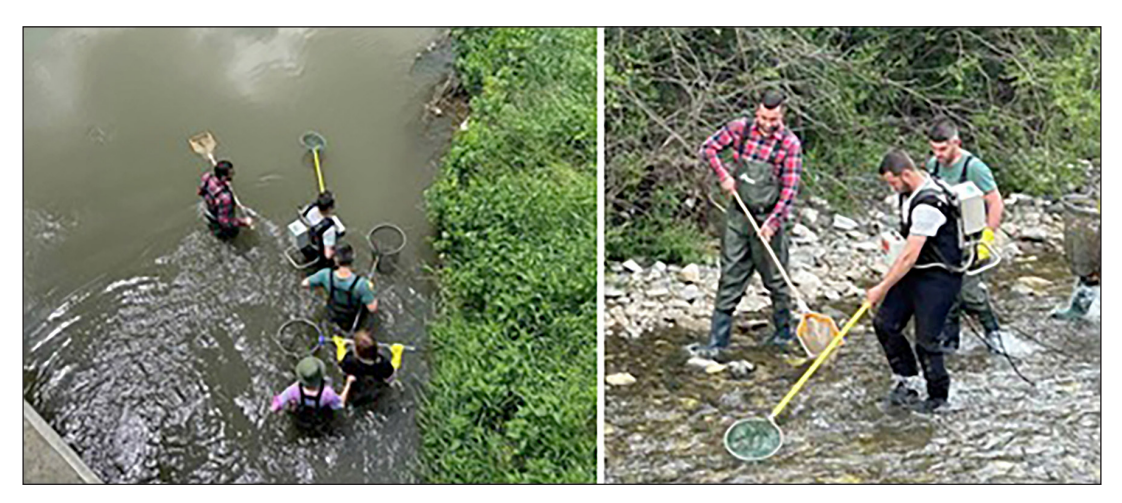
Figure 2. Fieldwork activities in the Lepenc River Basin, Kosovo